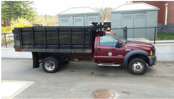
2006 FORD F-450 TRASH TRUCK