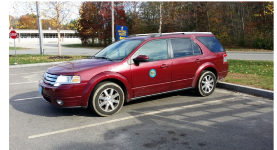
2008 FORD TAURUS MINIVAN (DEP SUPERINTENDENT)