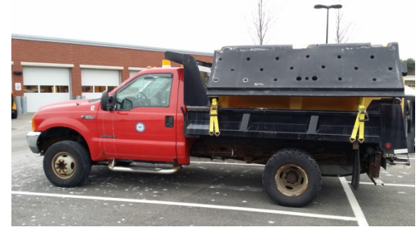
2001 FORD F-350 1-TON DUMP/SANDER