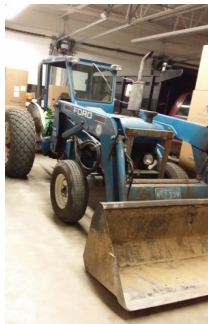
1994 FORD TRACTOR