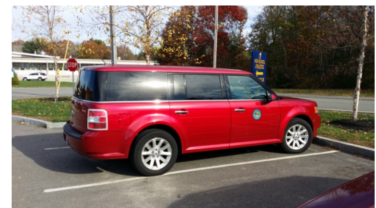
2012 FORD FLEX (FACILITY ENGINEER)