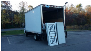
2006 GMC BOX TRUCK w/ LIFT GATE