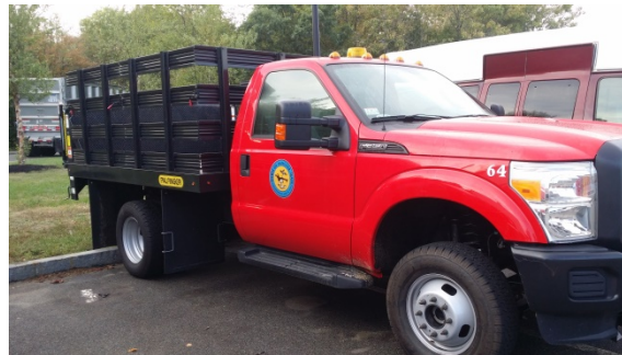
2016 FORD F-350 RACK BODY