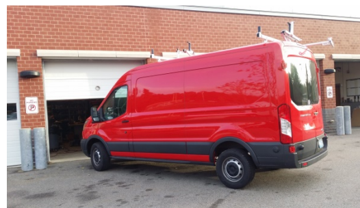
2016 FORD TRANSIT VAN