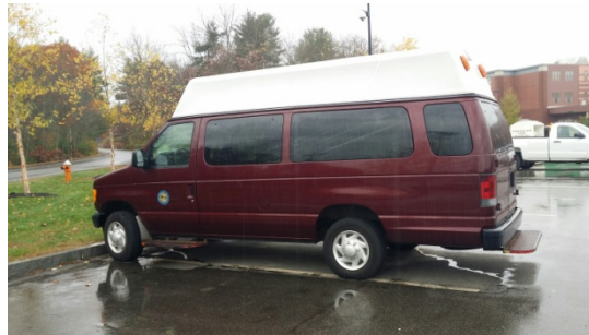
2006 FORD FREESTAR (CUSTODIAL FOREMAN)