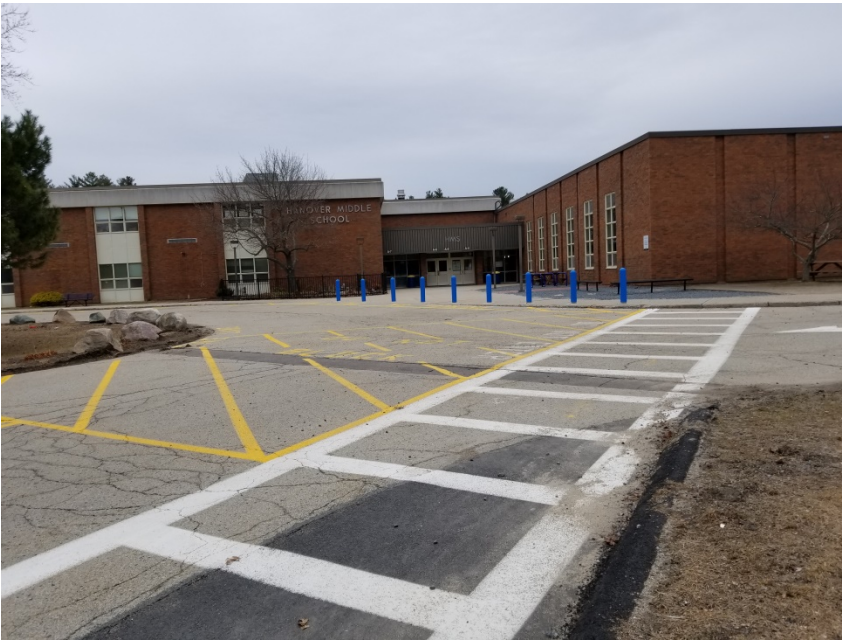
Bollards at Front Sidewalk