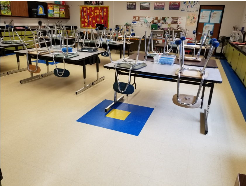
Replace Asbestos Floor Tile