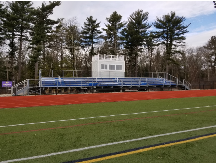
New Press Box