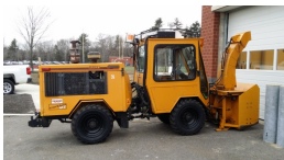
2007 TRACKLESS MTS TRACTOR