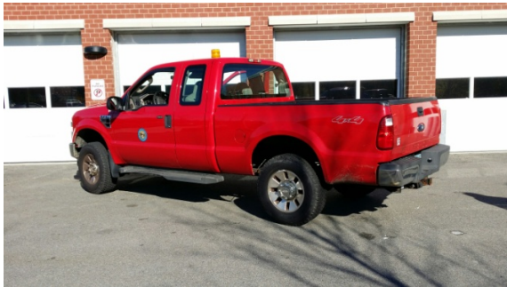
2008 FORD F-250 (MAINTENANCE FOREMAN)