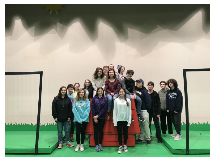
At The Bottom of Lake Missoula Spring- 2019 (Right)