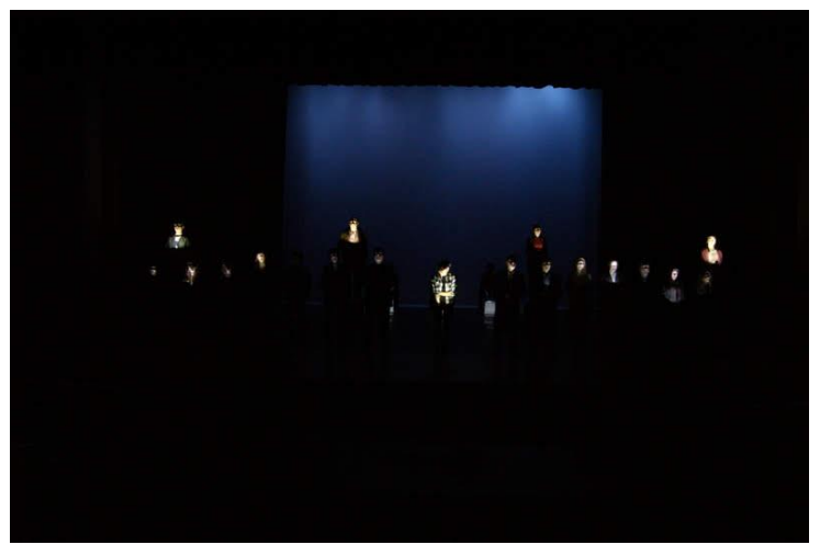
Little Shop of Horrors Fall- 2018 (Left)