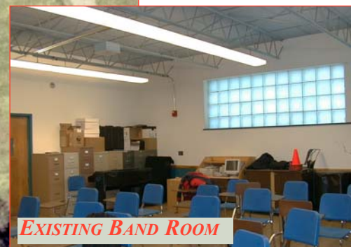
EXISTING BAND ROOM