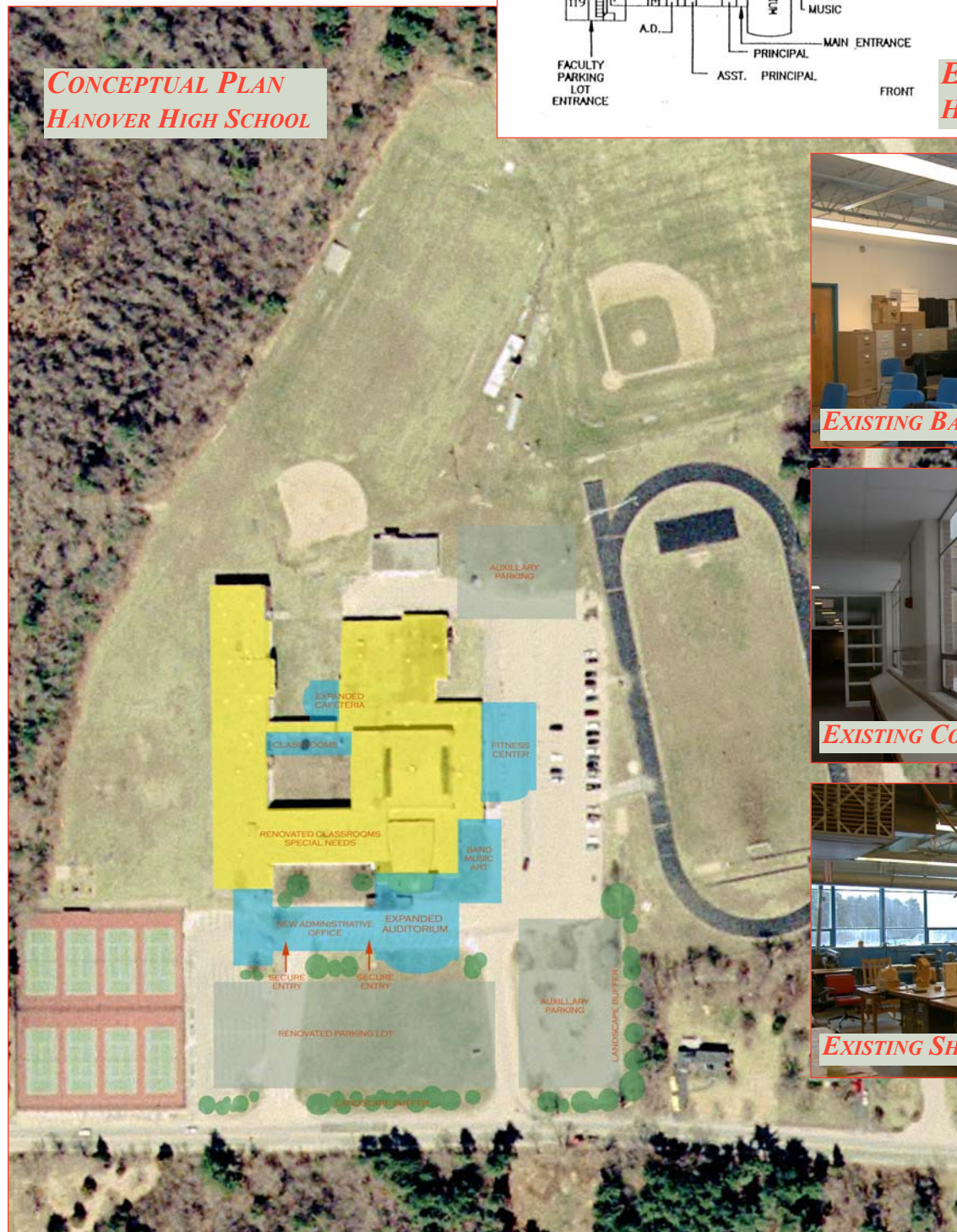
CONCEPTUAL PLAN HANOVER HIGH SCHOOL

The conceptual plan below is an example of the graphics Alderman & MacNeish will provide for the Town of Hanover. The additions, represented in cyan, reflect the input received at the three walkthroughs we have attended. Expansion of the core areas, Cafeteria, Gymnasium, and Auditorium, can be achieved with minimal renovation to the existing building. The addition is located in the front of the existing building to give the perception of an entirely new building. Additional classrooms, special needs, Music, Art, and administrative areas, are also incorporated into the conceptual plan. The administrative offices are located at the front of the building with flanking entrance vestibules providing a secure entry into the building.