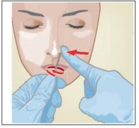
Figure 2. Nasal Swab Collection for First Nostril

Repeat on the other nostril with the same swab, using external pressure on the outside of the other nostril (see Figure 3). To avoid specimen contamination do not touch the swab tip to anything other than the inside of the nostril.