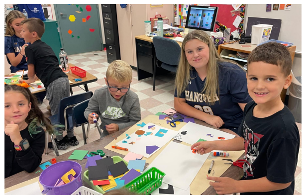
First grade students are enjoying art class with the Hanover High School mentors!

Kindergarten families: Ask your kindergartener how to make tints and shades! We learned adding white to a color makes it lighter (tint) and adding black to a color makes it darker (shade).