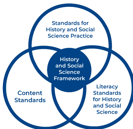
Figure 1: This image represents the three pillars of the History and Social Science Framework. Each pillar is designed for integration with the others.

Standards for Literacy in History and Social Science, Pre-K–5, 6–8, 9–10, 11–12